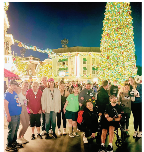
CASA DE CARIDAD POSES BY DISNEYLAND'S ICONIC CHRISTMAS TREE.