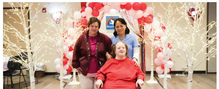
YOUR SUPPORT MEANS THE WORLD TO OUR ROCK STAR TEAM.

donations and rank in the top 20 among all large organizations participating in San Diego Gives' Day of Giving. Thank you all for your continued support!