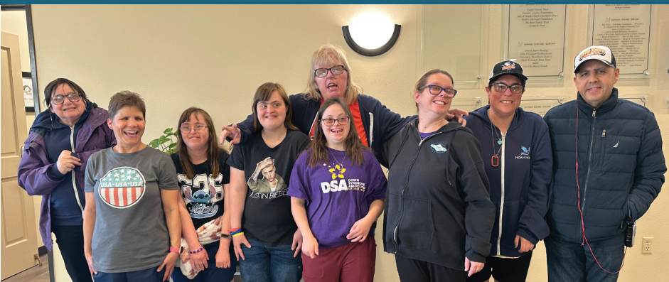
THE NEWLY ELECTED PEOPLE FIRST OFFICERS POSE TOGETHER.