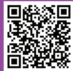
Watch the folks react to the election results here!