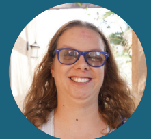
Alyssa Board of Directors